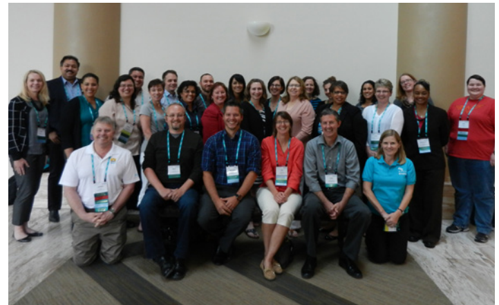
Emerging Leader Alumni gather at APHL's 2016 Annual Meeting

Anyone who is a supervisor or manager should seriously consider becoming a leader, too.