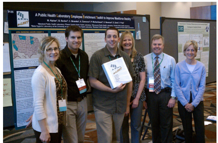
Cohort 3 displays their poster presentation at the 2011 APHL Annual Meeting